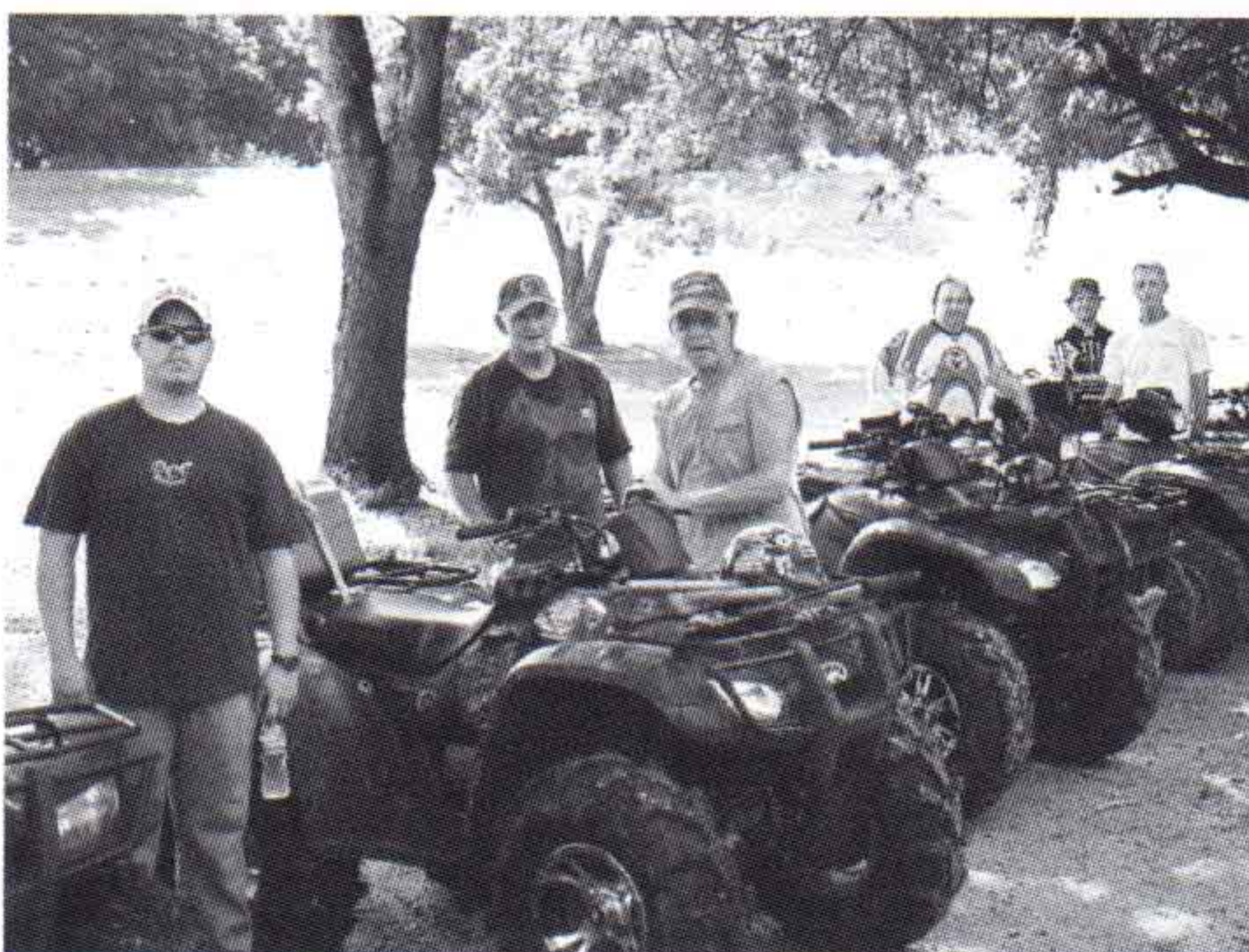
Some volunteers who helped with the park.

Special thanks to all the volunteers and to Greenville Motor Sports for providing equipment and labor.